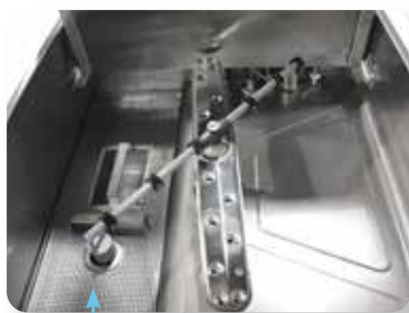
Fitted with surface filter