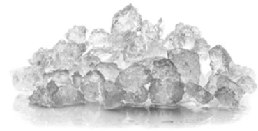
Residual water content 25%