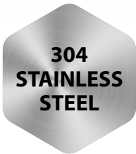
304 STAINLESS STEEL