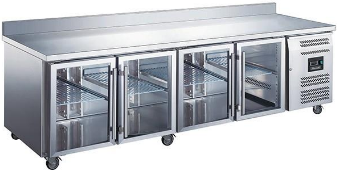
Image shown is HBC4CRXX With Upstand